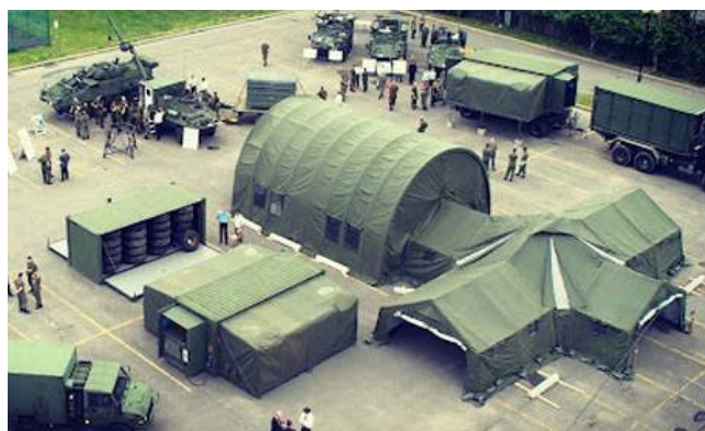
Tactical Operations Centers