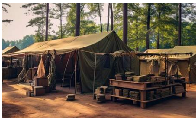
Tents & Field Camps