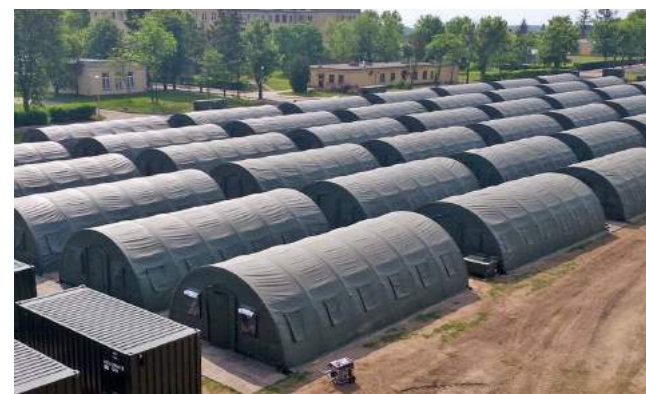
Tactical Operations Camps