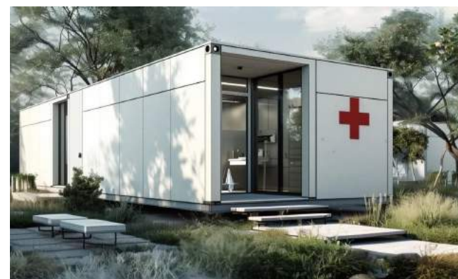
Mobile Field Clinics