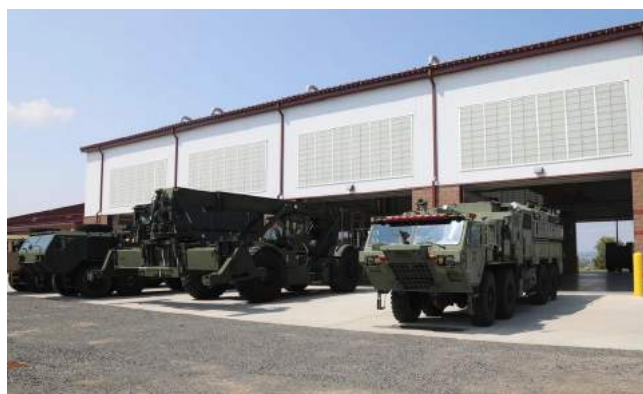
Maintenance Facilities & Hangars